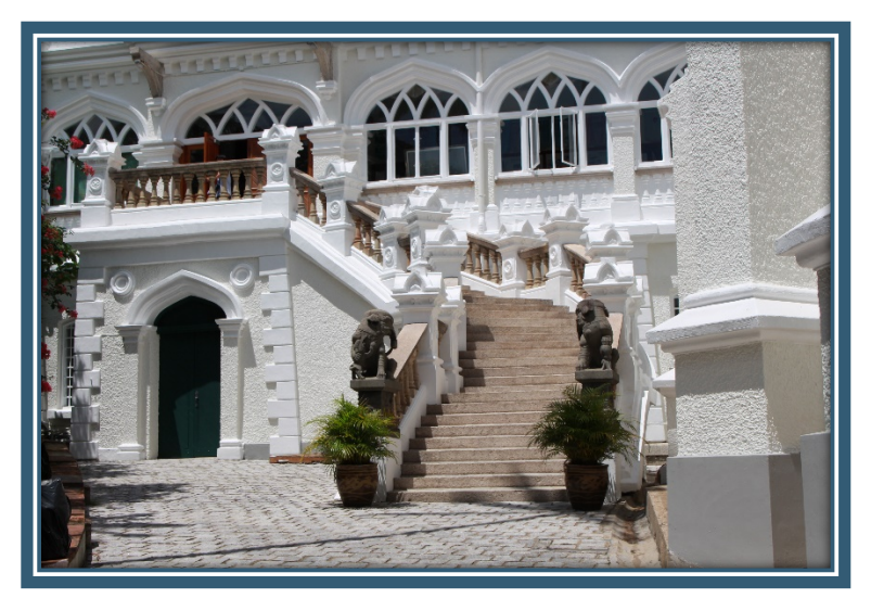
Photo: University Hall of the University of Hong Kong (former Nazareth Press)

Owing to the long distance from the city centre, the Nazareth Press needed a staff quarters nearby. The MEP purchased a land plot from the Swire Group, known as Taikoo yeunghong (foreign company) in Chinese, and built the quarters, naming it "Taikoolau" (Taikoo building). In 1935, MEP began planning for a new church and a school. At that time, there were already 48 families in Taikoolau, with more than 300 residents. Most of the early residents came from Shunde and Dongguan in Guangdong province, and were recruited by missionaries to work in Hong Kong. Later, villagers from Yim Tin Tsai, another Catholic village in the New Territories, also came here to live and work. Our Lady of Lourdes Church was consecrated three years later in 1938. The open area outside the