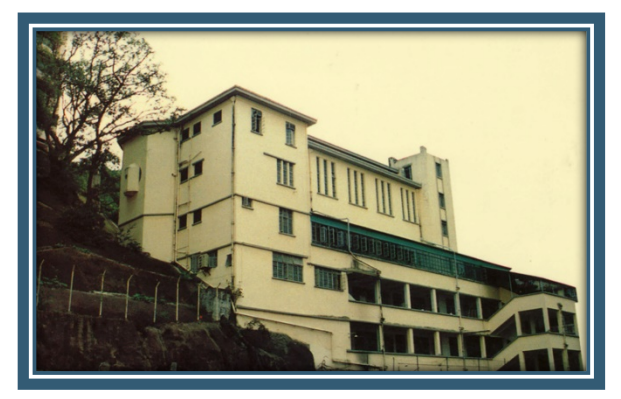
Photo: The old Our Lady of Mount Carmel Church before demolition (1990)

after the war and sought donations from various sectors to cover the construction cost. Father Giacomo Zilioli (PIME, 1898-1960), the first pastor of the chapel, and the laypeople actively contributed Requiem Masses to raise funds. The Holy Souls Church was finally constructed in 1950. A primary school, Ki Lap School, was also attached to it. Apart from evangelising, the Holy Souls Church also helped many deprived families by providing relief supplies. In 1957, the Holy Souls Church was renamed as Our Lady of Mount Carmel Church.